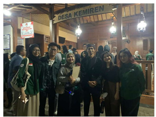
Figure 3 . Interview with the Head of Pokdarwis of Kemiren Tourism Village

The community in Kemiren Tourism Village actively supports tourism activities by providing the famous local cuisine of Banyuwangi, namely 'Pecel Pitik'. This dish is served with sambal tempong to add a distinctive flavour. Using local people as food providers for tourists also gives the impression that the food served is an original recipe passed down from generation to generation within the local community. This is distinctive and sets it apart from the food served in other large restaurants. The simple and welcoming atmosphere, along with the unpretentious service, creates a sense of familiarity that can make tourists feel at home and nostalgic for home-cooked meals.