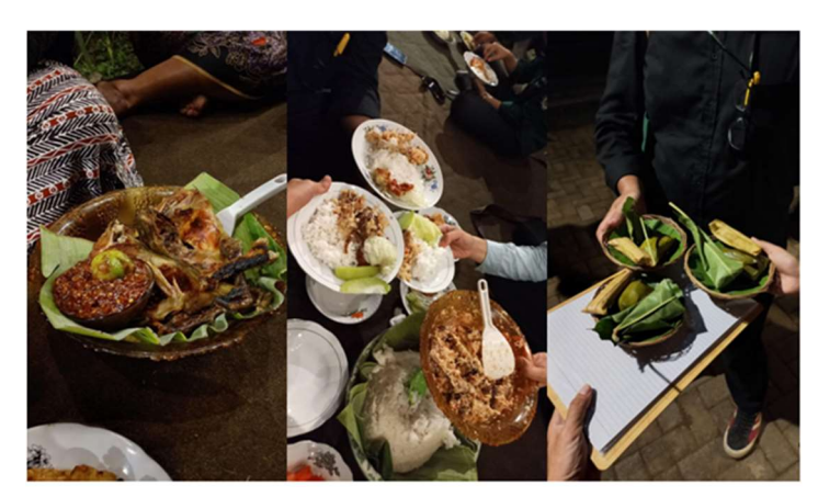
Figure 2 . Community Involvement in Preparing Tourism Consumption

Emphasising the role of local people in homestay management can create a sense of ownership and empowerment within the community. This can lead to communities feeling the positive impact of being actively involved in tourism management in their own villages. Additionally, the growth of the tourism sector can create new jobs, which can help to reduce the unemployment rate in local communities. Meanwhile, local communities can also contribute to the preservation of culture and tradition by managing homestays. Tourists often seek authentic experiences that reflect the richness of the local area.