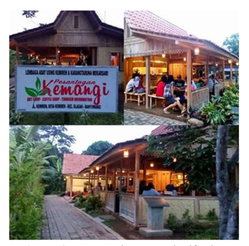
Figure 4 . Community-Owned Gift Shop

Local communities can contribute to the tourism sector through souvenir shops. These shops often employ local workers and sell products that are locally produced, which can help to empower the local economy. It is important to note the role of local community participation in economic empowerment. To maintain objectivity, it is recommended to avoid subjective evaluations unless clearly marked as such. The products offered by Kemiren Tourism Village serve not only as a means of promoting the local community but also as a way to showcase their unique identity to a wider audience.